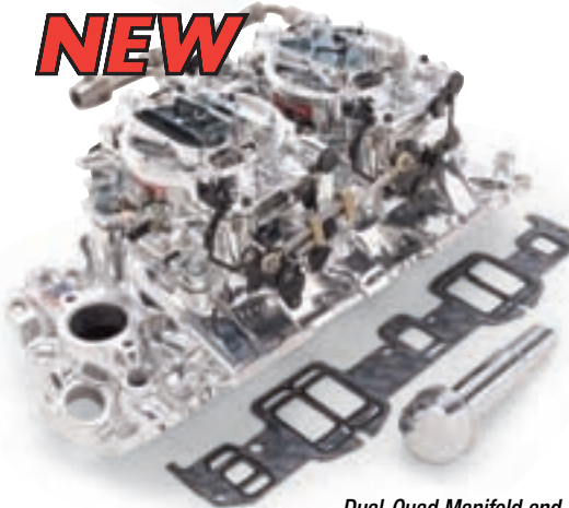
Dual-Quad Manifold and Carb Kit #20674 with EnduraShine Finish