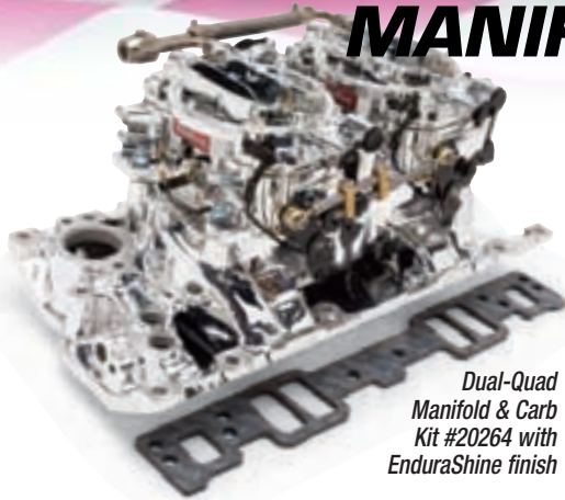
Dual-Quad Manifold & Carb Kit #20264 with EnduraShine finish