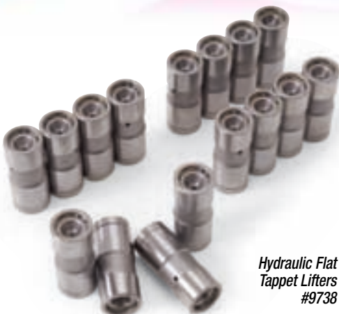
Hydraulic Flat Tappet Lifters #9738