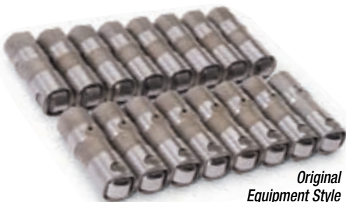
Original Equipment Style Hydraulic Roller Lifters #97384